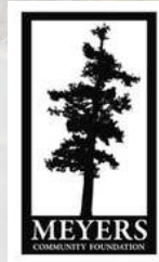
Meyers Community Foundation