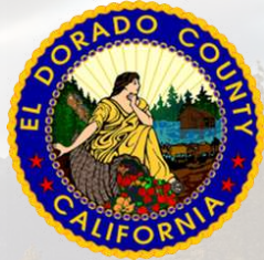
Brooke Laine EDC Board of Supervisors, Dist. 5

These early advocates recognized the potential of this project from the start. Their vision is helping transform public space into a meaningful, lasting expression of community, creativity, and connection.