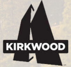
Kirkwood Mountain Resort