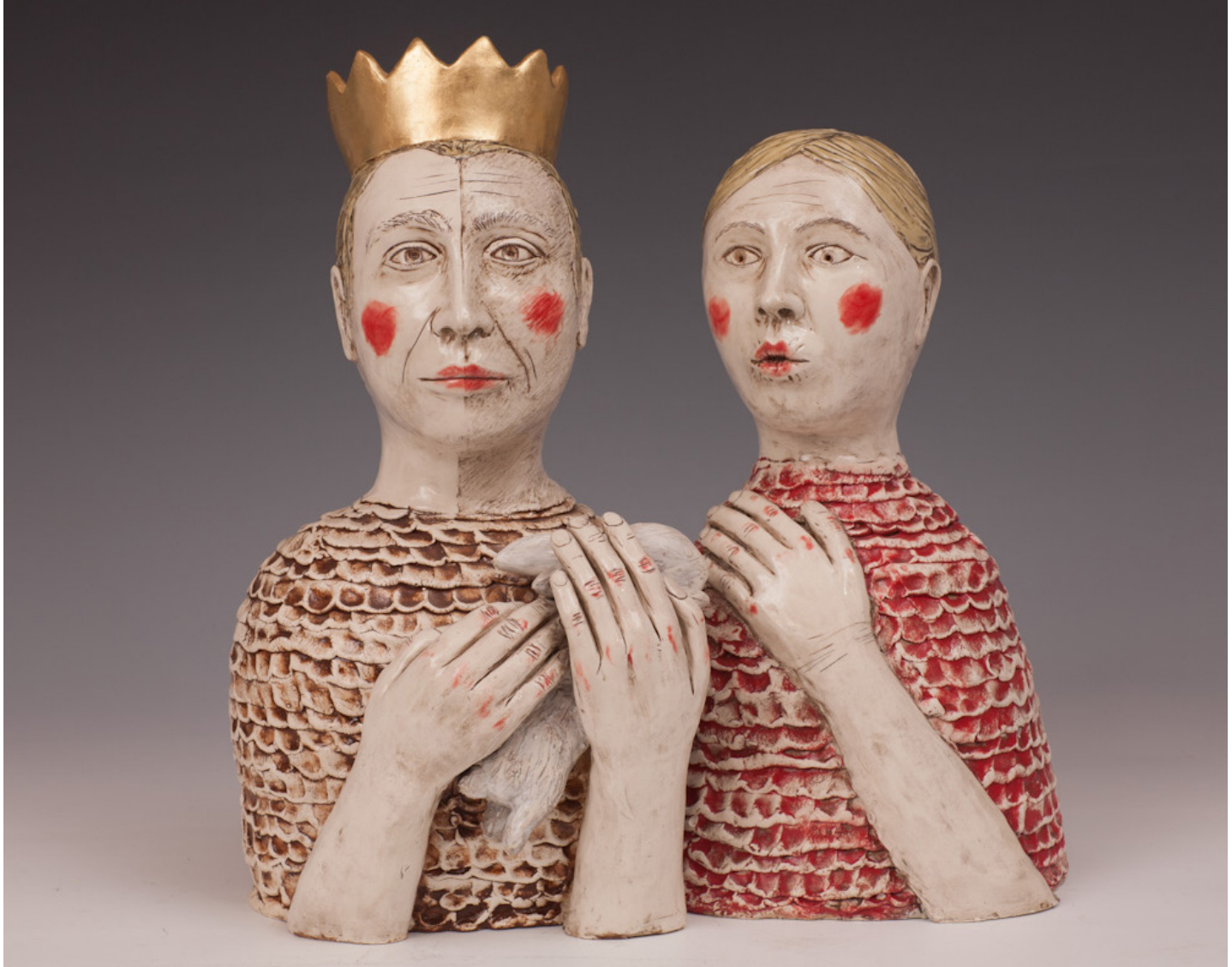
Katie Morris The King and Me Ceramic/Porcelain 2012