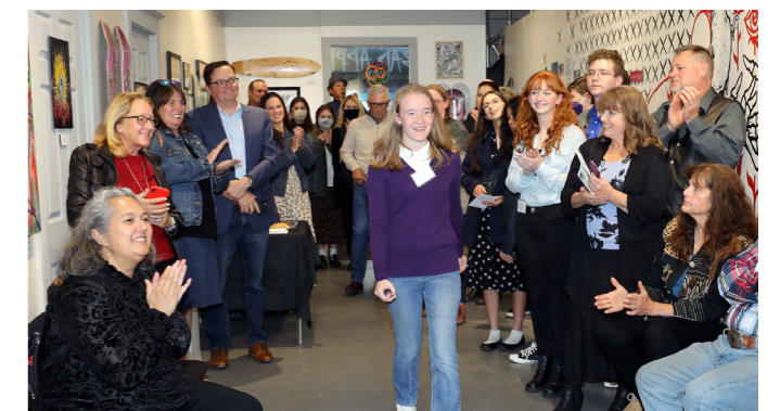
Young Artist Awards: An annual program, the Young Artist Awards recognize the special potential of El Dorado County High School Juniors and Seniors in four categories: Music, Theatre, Visual Art, and Nature-Inspired Art.