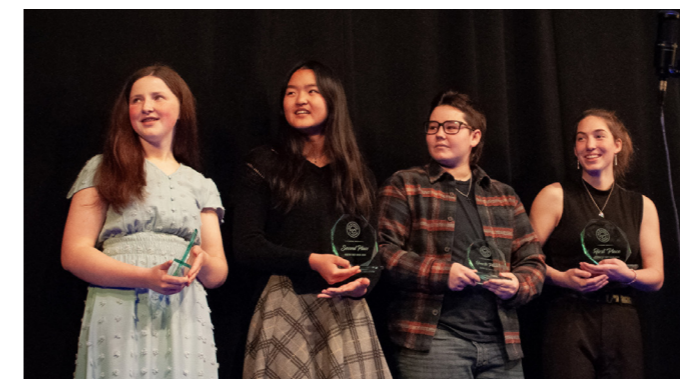
Poetry Out Loud: Poetry Out Loud is a national poetry recitation competition for high school students, administered locally by Arts and Culture El Dorado.