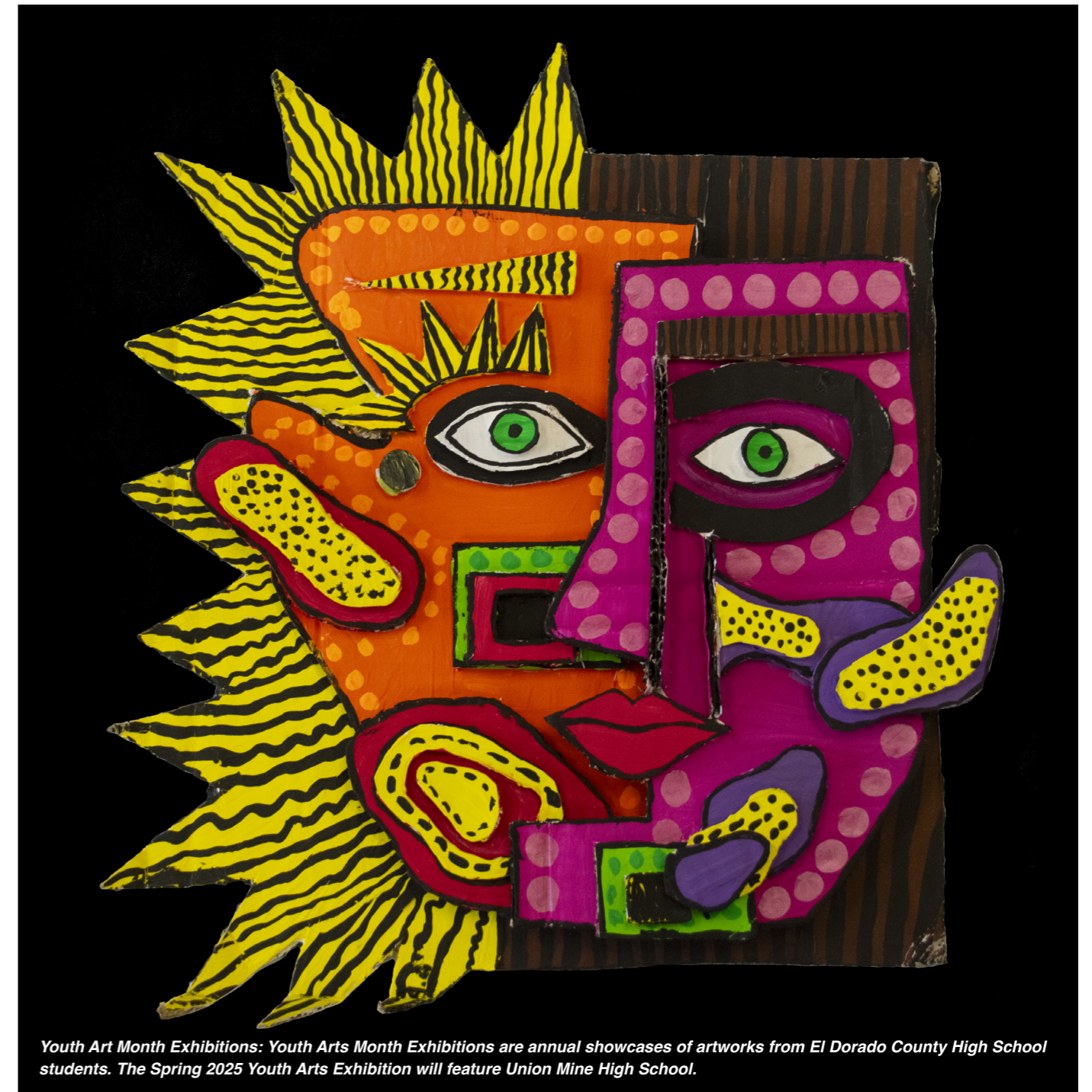
Youth Art Month Exhibitions: Youth Arts Month Exhibitions are annual showcases of artworks from El Dorado County High School students. The Spring 2025 Youth Arts Exhibition will feature Union Mine High School.