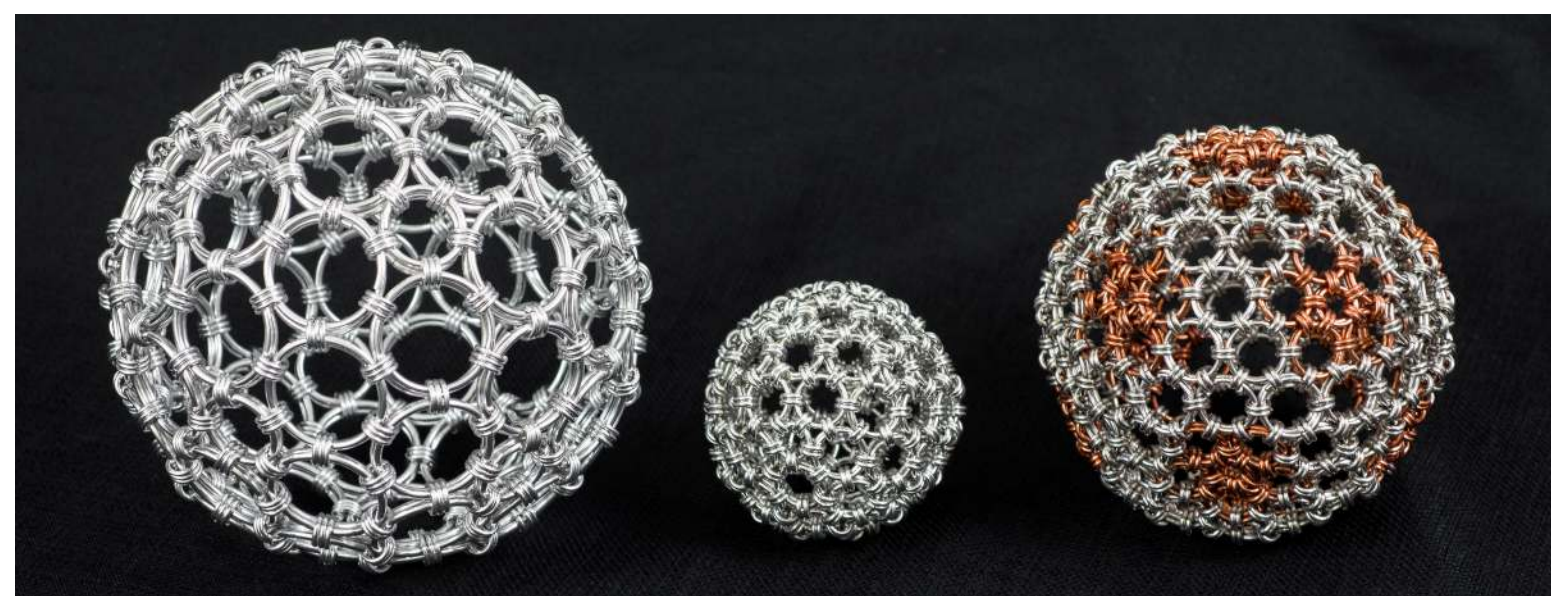
Stacey Wyatt Japanese Spheroid Polyhedra, Large, 2018 Aluminum

Stacey Wyatt Japanese Spheroid Polyhedra, Small, 2018 Aluminum