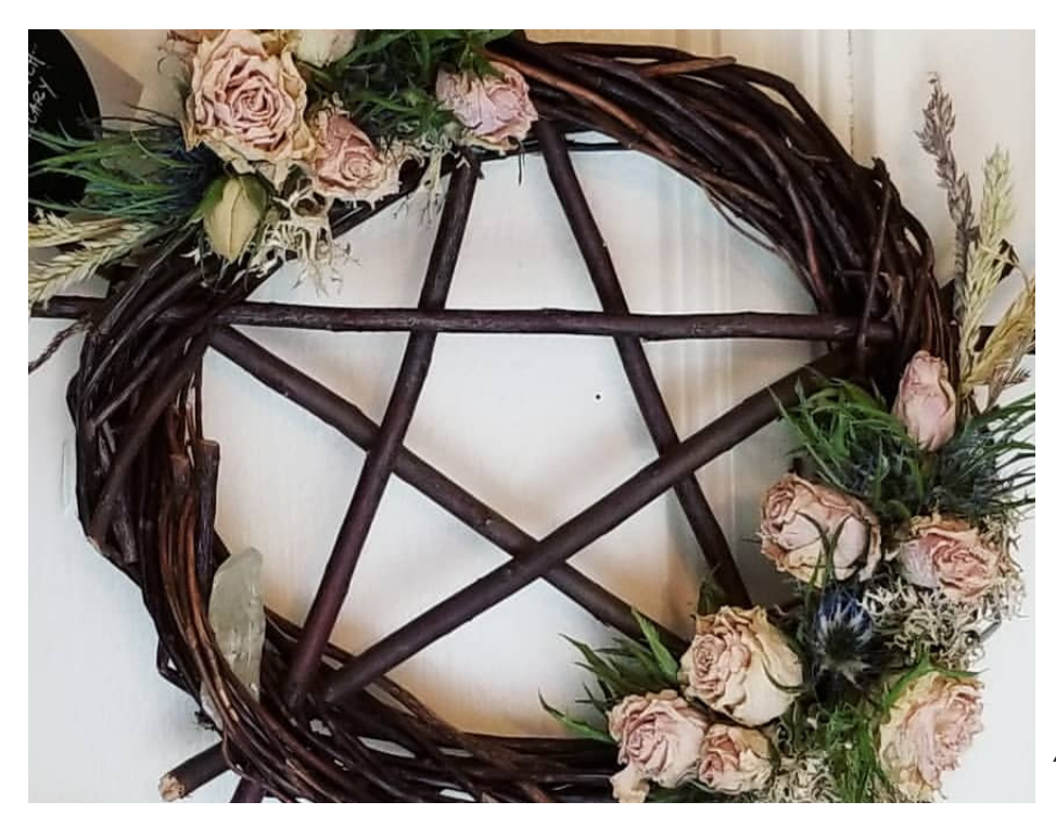
Rachel Wessman Herbal Wreath, 2019 Plant materials