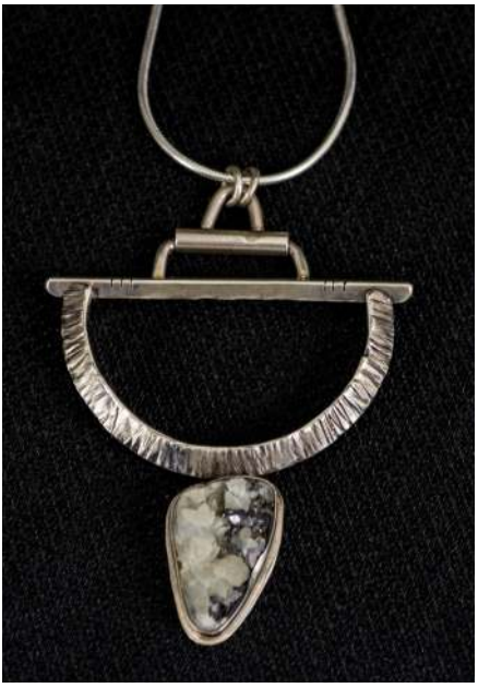
Leah Delmar Australian Sunrise, 2019 Jewelry, mara mumba tigers eye and sterling silver and sterling silver